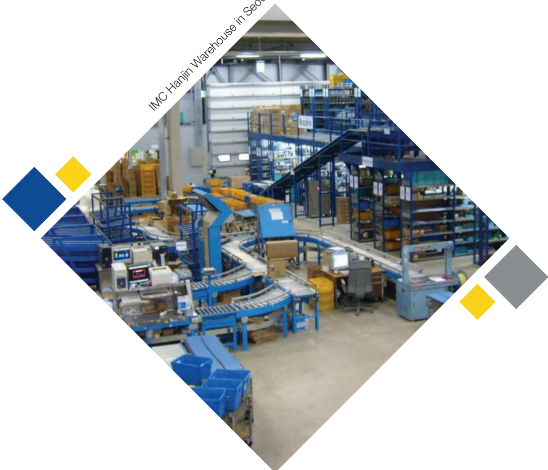
IMC Hanjin Warehouse in Seoul

Transactions with Russia. As a result of broad U.S. economic sanctions programs targeting Russia, no U.S. origin commodities, software, or technology/technical data (collectively referred to as "items") subject to U.S. export control laws and regulations ("collectively referred to as "U.S. items") shall be exported, reexported, sold, or supplied to customers located in Russia, whether directly or indirectly (including through distributors, sales agents, or other third-party intermediaries or Business Associates wherever located). If you believe a transaction with Russia may involve U.S. items, then IMC Compliance Officer must be immediately notified and the transaction shall not proceed without his/her prior approval.